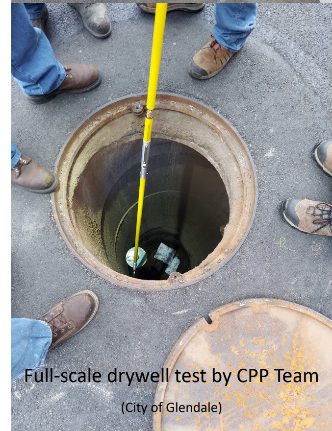
Full-scale drywell test by CPP Team (City of Glendale)