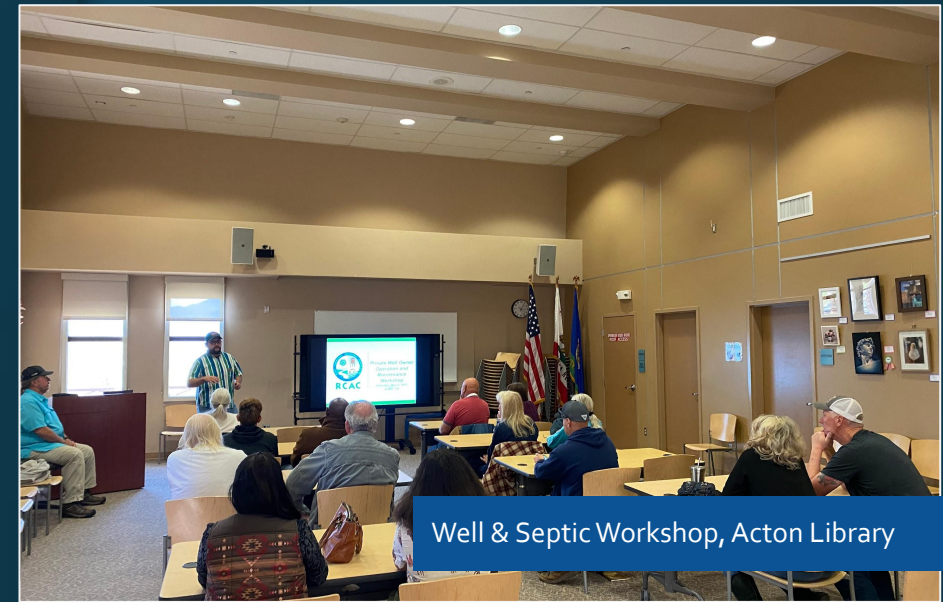
Well & Septic Workshop, Acton Library