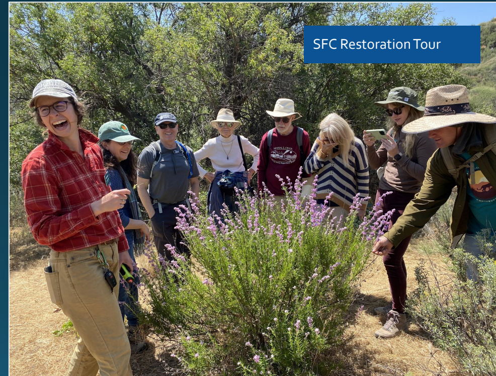
SFC Restoration Tour