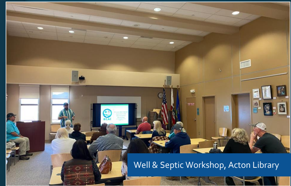
Well & Septic Workshop, Acton Library