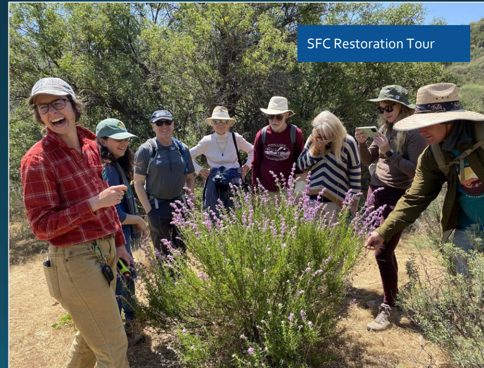
SFC Restoration Tour