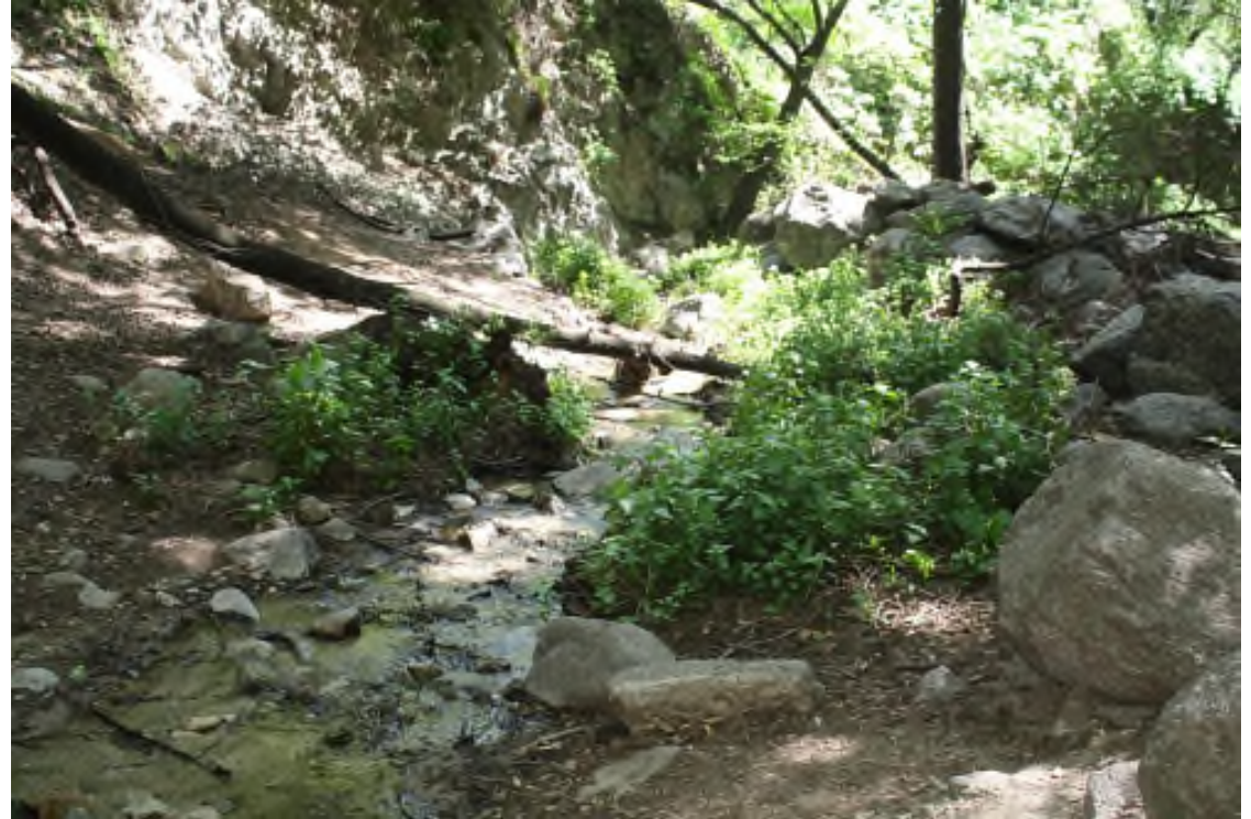
Monrovia Canyon Park