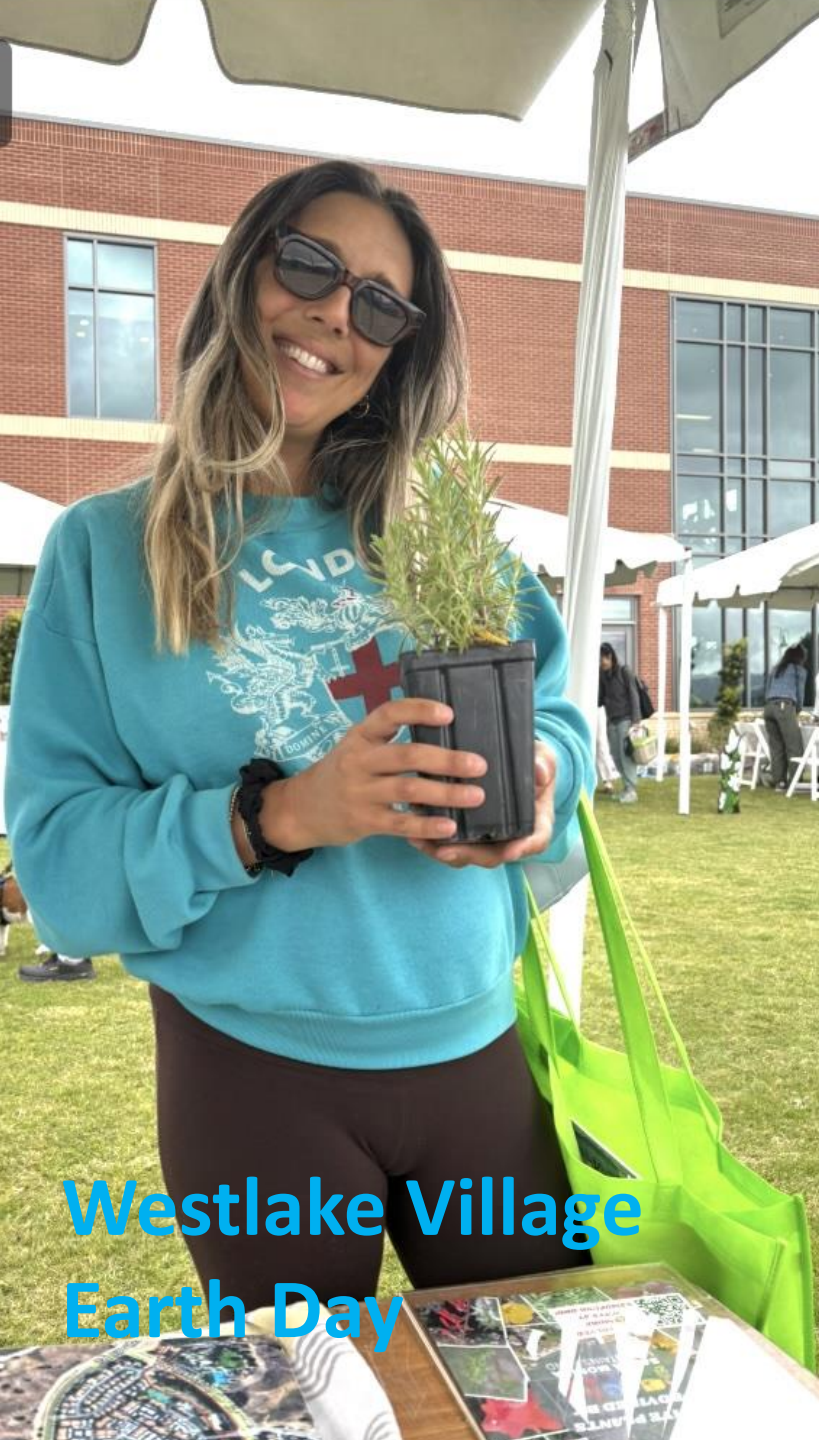
Westlake Village Earth Day