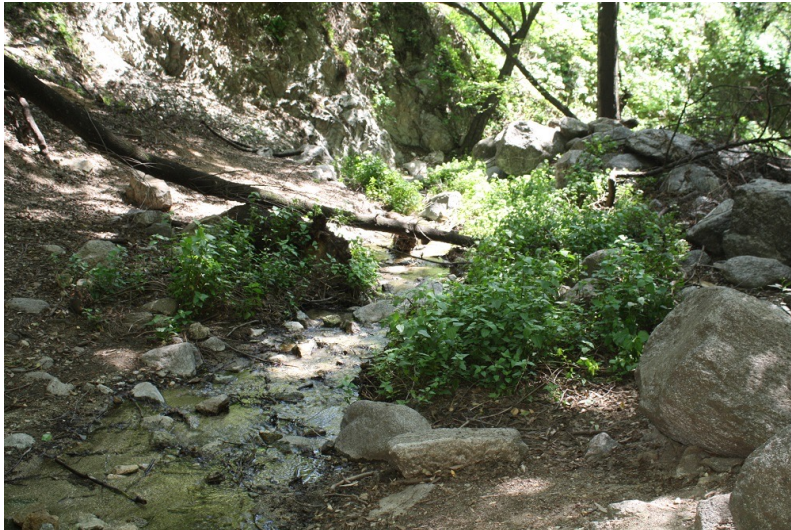
Monrovia Canyon Park, Photo Courtesy City of Monrovia