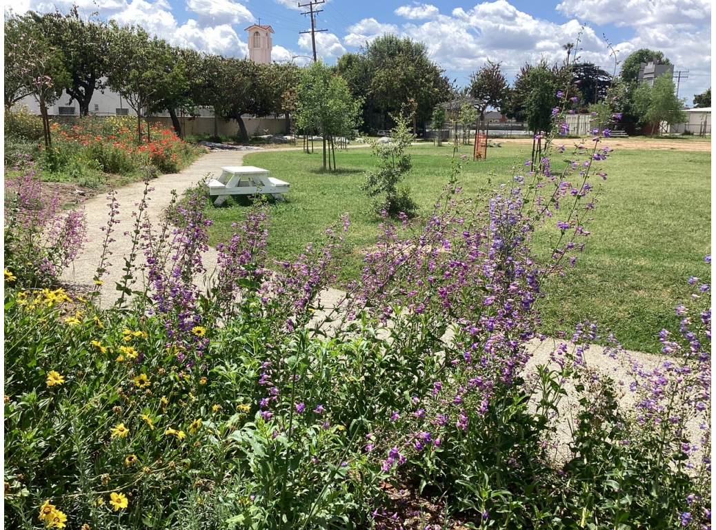
Plymouth Elementary School, Monrovia