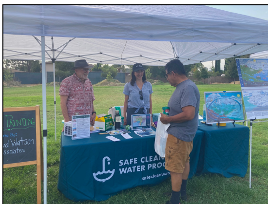
El Monte “Beach Day,” sponsored By Day One