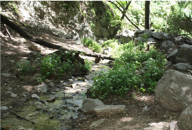
Monrovia Canyon Park, Photo Courtesy City of Monrovia