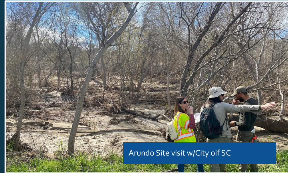
Arundo Site visit w/City of SC