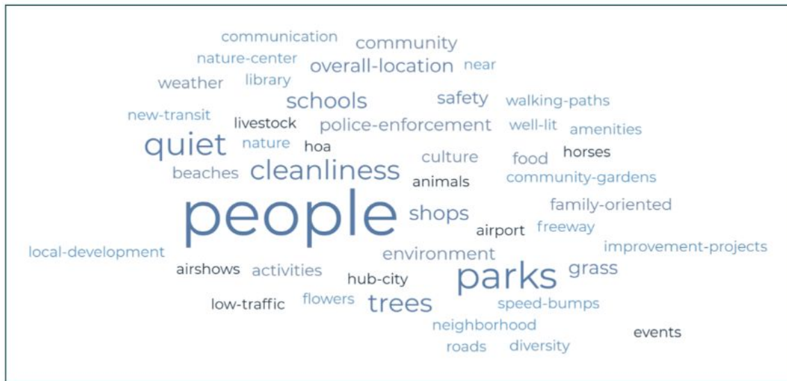
Figure 4: The above word cloud identifies the most common words used in this optional, open-ended response question, with the larger words indicating higher frequency. The top four most frequently used words were people, parks, quiet, and cleanliness.